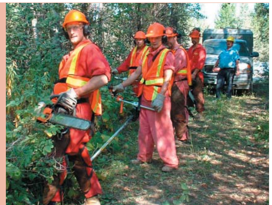
Brushing of the Cluculz Lake site was conducted in late August by the Prince George Regional Correctional Centre.

Brushing work was completed last month by a hard working crew from the Prince George Regional Correctional Centre. The crew spent nearly a week widening the path through the site, opening it up to researchers and members of the public.